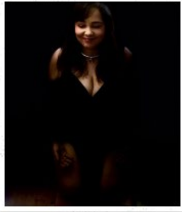
SLAVE GAIA AMOR