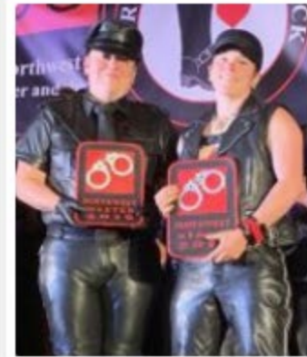
Master Rook & slave rook

2019 Southwest Master & slave Titleholders