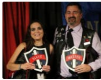
Sir Edgar and slave raven

2019 Southeast Master & slave Titleholders